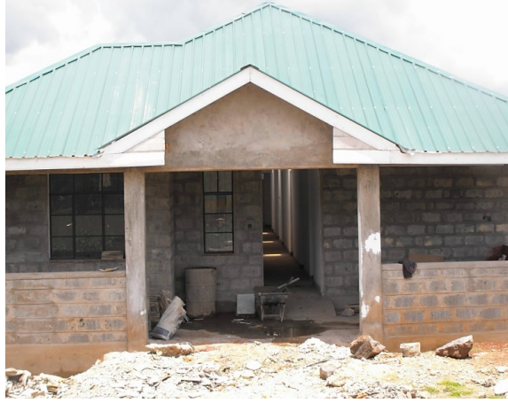
Upper entrance to Noah's Ark

The whole place is wonderful to see and once it is complete, it will be one of the most beautiful spots on the farm.