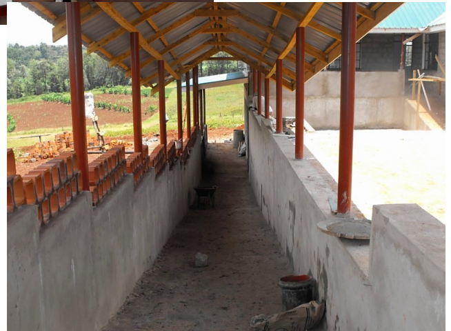
Ramp from lower level to upper court yard