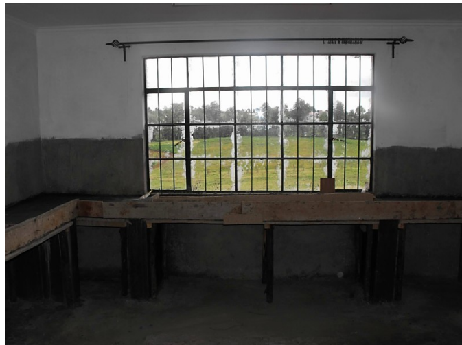
Kitchen— over- looking Tumaini farm